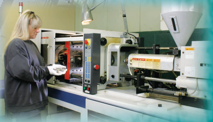
State-of-the-art "artificial intelligence" molding machines.