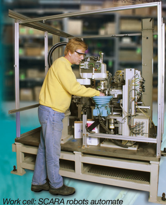
Work cell: SCARA robots automate assembly for high volume orders.

Certified welders handle each part in our low-hydrogen environment. Each welder is re-qualified annually